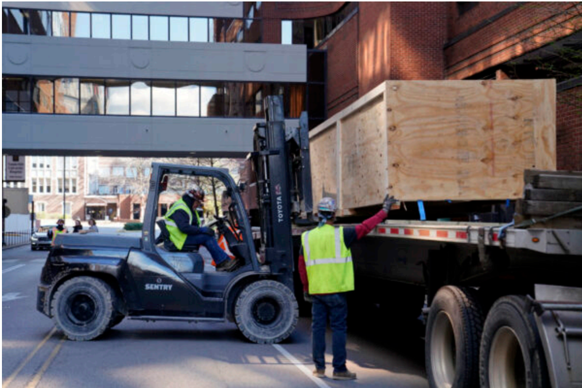
Day three: The two-ton bronze sculpture has been carefully placed in its shipping crate and on this relatively low-traffic Saturday morning, April 9, Richard Holder of Sentry Steel drives the fork lift as it is loaded on to a truck for transport.